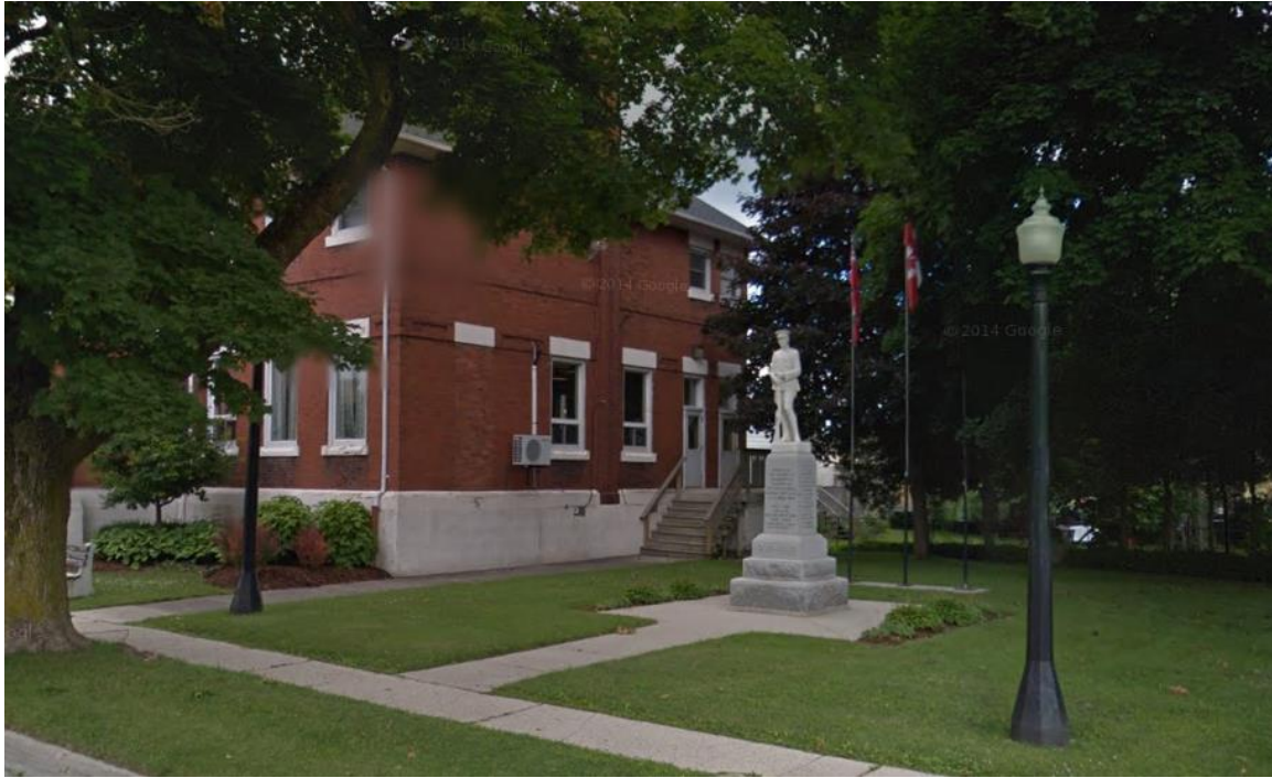
Cenotaph Lands before restoration by County

The encroachment agreement and transfer of lands are to be for nominal consideration. There will be legal costs that should be less than $2,000. For some time now the Federal Government has provided grants for restoring and improving cenotaphs. So long as this program continues, the Town should be eligible for grant funding under this program.