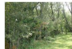
Rotary Park Loop