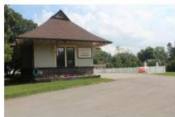
Train Station Outside