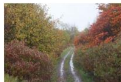
Rail Line Loop