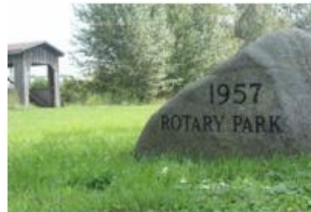
Clifford Old Rotary Park