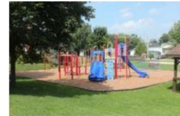
Clifford Cenotaph Park & Pavilion