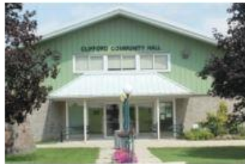
Clifford Community Hall