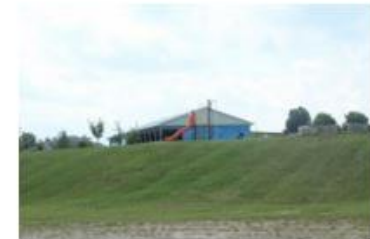
Clifford Rotary Park & Pavilion