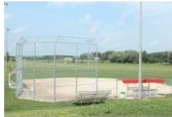
Clifford Ball Diamond