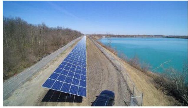
Single Row Configuration

If a contract offer is received for ground mount installation typically there is a public process involved before panels can be installed. Passing the requested resolution should not prevent the Town from commenting on the specifics location of the panel rows if this is a concern to Council.