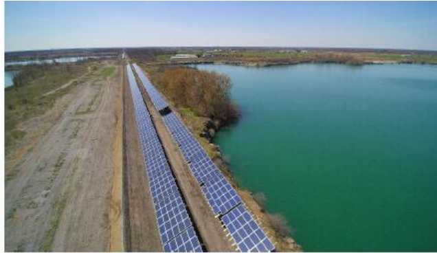
Double Row Configuration

The applicants will install along the rail lines in double or single row configurations as illustrated in the pictures below and outlined in their presentation.