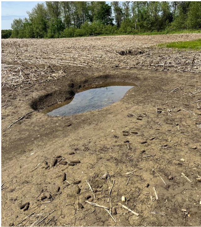
Figure 1- Photo taken of blowout on 5775 11th Line