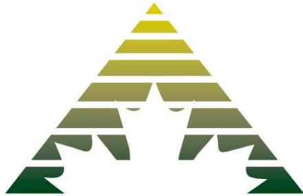
Saugeen Economic Development Corporation A Community Futures Development Corporation