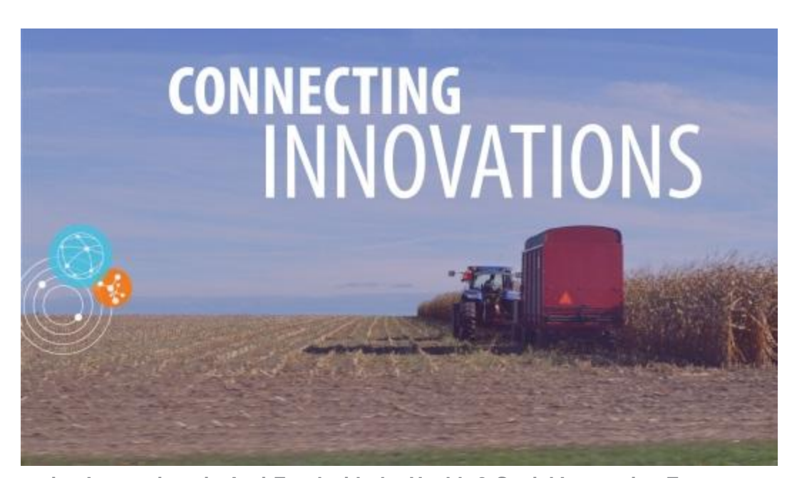
Connecting Innovations in Agri-Food with the Health & Social Innovation Ecosystem

Many innovations in health are focused on improving outcomes for patients. Recently, I had the opportunity to connect with dozens of thought leaders in the agri-food, environmental and life sciences industries through the Guelph Chamber of Commerce to hear about opportunities to do just that as well as support residents to live and stay healthy every day.