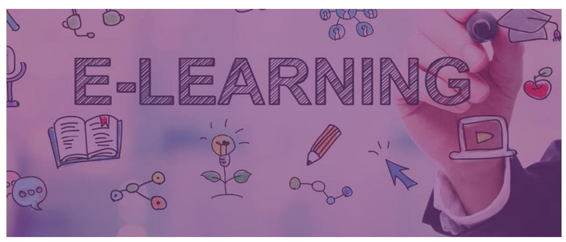
Expand Your Knowledge Through Free Online Course Offerings

The Waterloo Wellington LHIN is partnering with Langs Community Health Centre to offer 250 free Institute for Health Improvement (IHI) licenses to health partners throughout Waterloo Wellington.