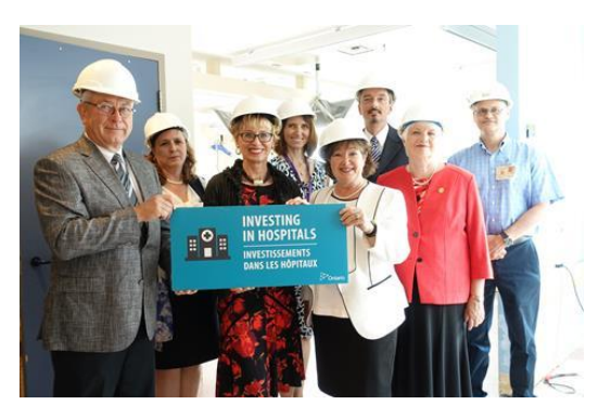
Additional $7.4 Million Announced to Support Hospitals Repairs and Upgrades

Local residents will benefit from a new investment of $7.4 million in local hospitals