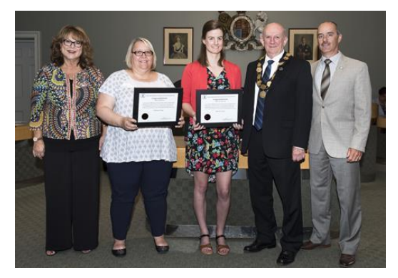
IMPACT Team Earns Honours for Work with Wellington OPP

Local residents will benefit from a new investment of $7.4 million in local hospitals